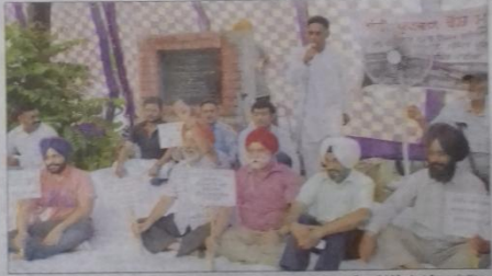
Members of the Traders and Property Owners' Association and Feroze Gandhi Market Association stage a dharna against the MC in Ludhiana on Friday.

LUDHIANA, JULY 14 Traders and shop owners at the Feroze Gandhi Market protested against the 'parking mafia' in and around the market here today. Members of the Traders and Property Owners' Association and Feroze Gandhi Market Association were part of the protest. They raised slogans against the parking contractors, Municipal Corporation, the tehbazaar wing, traffic police and parking contractors. They said nexus among them had made life difficult for the traders and shop and office owners.