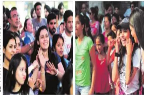
A group of people, likely students, looking towards the camera. The image shows a diverse group of young people, mostly women, smiling and looking in various directions. They appear to be at a public event or gathering.