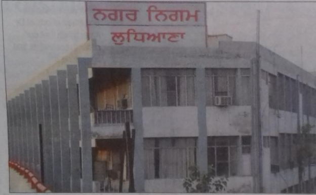
The Municipal Corporation will start giving online approval for building plans from September 1.

Officials of the Buildings Branch Department from all over the state were given necessary instructions about the online approval of maps at Chandigarh by Minister of Local Bodies Navjot Singh Sidhu.