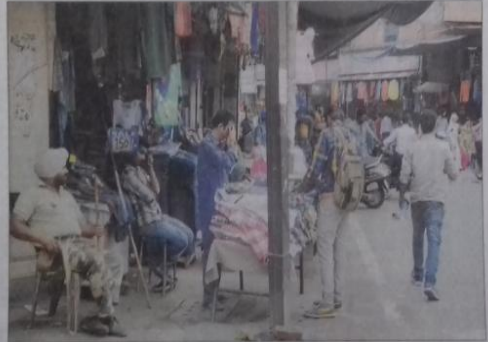
Chaura Bazar shopkeepers have encroached upon road.