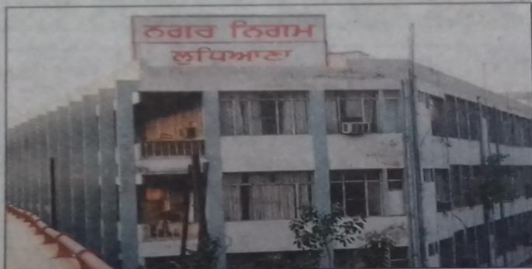
Officials revealed that total recovery from only water supply and sewerage would be somewhere around Rs100 crore

On Friday evening, a meeting was also conducted by additional commissioner Rishipal Singh to discuss ways of recovering dues from water supply and sewerage. Officials revealed that total recovery from only water supply and sewerage — which were pending for the past several years —