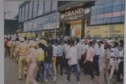
A crowd gathers at Grand Walk mall during MC action.