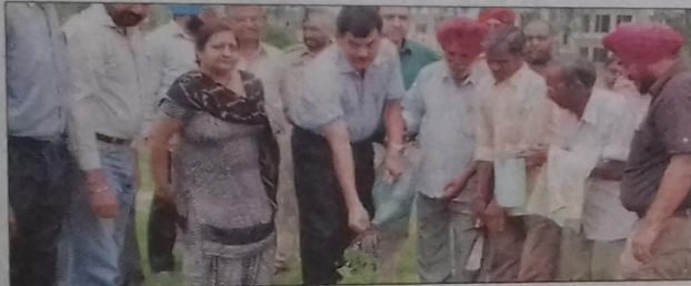
City-based NGOs are also pitching in for green-drive to create a friendly environment.

However, environmentalists caution that Vana mahotsav should not become a number game. "If an organisation or an NGO claims to