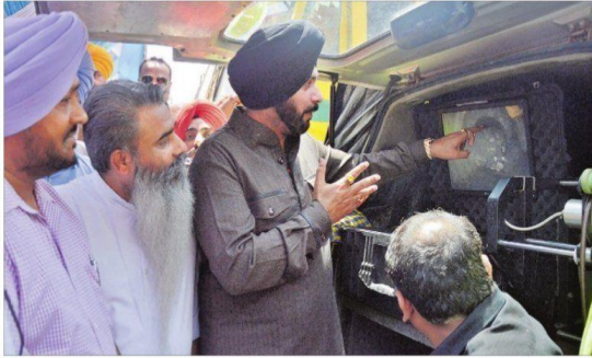
Local Bodies Minister Navjot Singh Sidhu during his visit to Rahon Road and Talab Bazar in Ludhiana on Saturday.

He said the A-Z company, which had received a lot of appreciation for bringing in a sea change in Indore, failed here for the simple reason that the company was being paid ₹1,200 per tonne to lift garbage in Indore, while here only ₹300 was being provided to the company. "We will come up with a policy soon, through which the processing of garbage will also be done. Fresh tenders will be floated and A-Z company will be