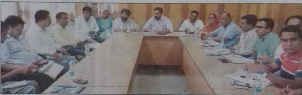
मीटिंग में अधिकारी व कमेटी के मेंबर।

लुधियाना, 17 जुलाई (हिवाेश): नगर निगम द्वारा स्ट्रीट वैडर पॉलिसी को लागू करवाने के लिए जो सर्वे करवाया जा रहा है, उसके तहत 5 साल पुराने रेहड़ी-फड़ी वालों को वैडिंग जोन में जगह देने का फैसला किया गया है।