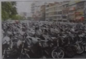
Two-wheelers parked at a parking lot in Feroze Gandhi Market.

that don't have the slips of parking lots on the vehicles." "If some vehicles are in no-parking zone then all of them should be towed away, why are the vehicles with the parking slips spared?" That proves that contractors work hand in glove with the tehbazaar wing workers," he said. Moreover, parking lot contractors get twice the number of vehicles parked inside parking lots than the number of vehicles allowed, which makes the parking unreasonably congested, blocking the way," he said. "In case of any emergency such as fire, there will be no space for fire tenders to go through the harrowing time because of the bullying by the parking lot contractors. Even the MC doesn't pay attention to the area. There are parks in the area, but these are ill-maintained. One of them is encroached, but no action is taken by the corporation," he said. He said they had already written to the MC regarding the problem related to parking contractors and mafia, but no action had been taken about it.