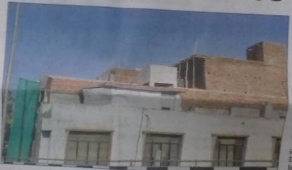
Illegal construction being carried out on the rooftop of a building in Ludhiana.