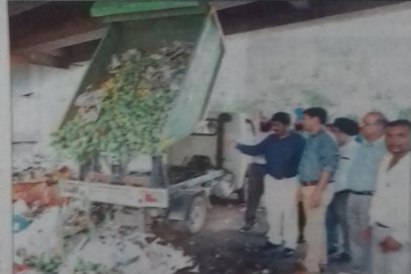
मसाले से पकाए फल नष्ट करवाते अधिकारी।

लुधियाना, 7 जुलाई (हिंदी): नगर निगम व सेहत विभाग ने उन लोगों पर कार्रवाई शुरू कर दी है जो मसाला यानी कि कैल्शियम कार्बाइड डस फलों को पकाकर बेचते हैं। इसके सहित गिल रोड के इलाके से गिरे करीब 2 क्विंटल आम जल करके नष्ट कर दिए गए।