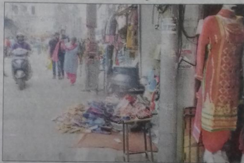
Most Chaura Bazar shopkeepers have encroached upon road.

On being asked if action would be taken against the