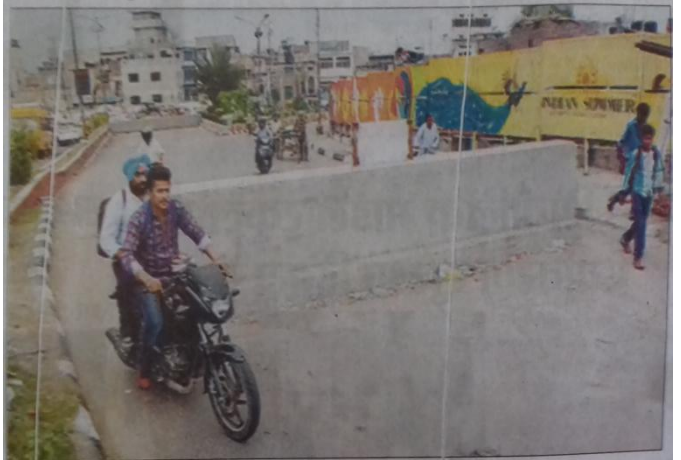
जगहों पुल का दृश्य।