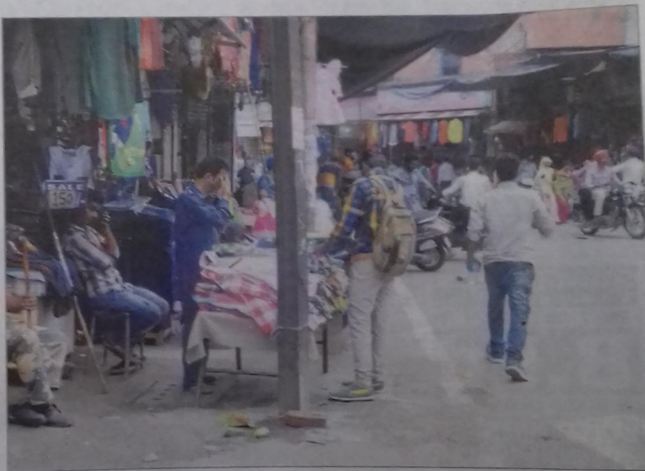
A file photo of Chaura Bazaar.

pal authorities have failed to maintain the status of the encroachments that were removed as these temporary encroachments have cropped up again. One can easily see encroachments over the road from Girja Garh Chowk to Ghas Mandi Chowk of the Chaura Bazar, he said.