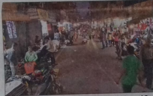
चौड़ा बाजार में दुकानदारों की ओर से किए गए कब्जे।

28 अगस्त को है निगम अधिकारियों की हाईकोर्ट में पेशी