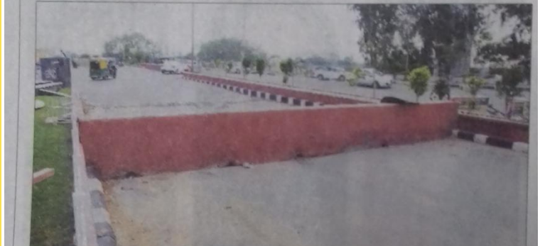
One side of the Jagraon Bridge has been closed for safety reasons. A FILE PHOTO

PIDB to release amount soon; work to start in 2-3 months