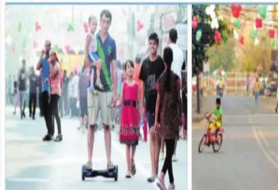
People participating in a Raahgiri event on a smart road in Ludhiana. The image shows a group of people, including children and adults, walking and cycling on a wide, paved road decorated with colorful balloons and streamers. The scene is festive and appears to be a community event.