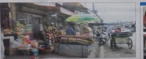
Most shopkeepers have encroached on Daresi Road in Ludhiana.

Shopkeepers spend nearly half an hour every morning arranging articles outside their shops on Daresi Road. Thereby encroaching upon the road. In no time, vegetable vendors and fruit sellers, too, come and station their carts alongside.